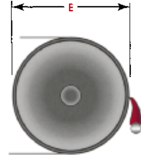
E - PULLEY DIAMETER